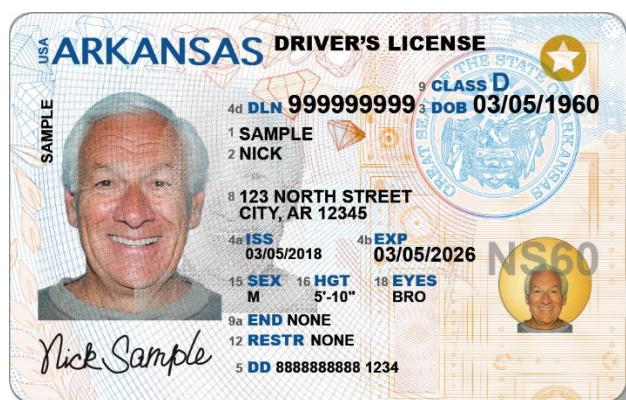
(REAL ID Driver's License)

Arkansas is taking part in the federal nationwide initiative to improve the security of state-issued driver's licenses and identification cards, which will help fight terrorism and reduce identity fraud. On May 3, 2023, anyone who boards a domestic flight or enters a federal building will either need a REAL ID driver's license (DL) or Identification Card (ID) or will need to provide a regular identification and additional accepted forms of identification.