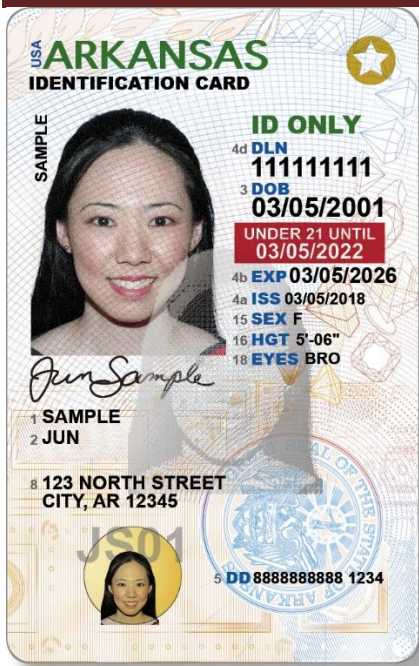
(REAL ID Identification Card)