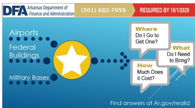
(Front of Card)