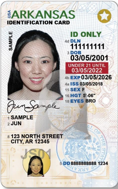
(REAL ID Identification Card)