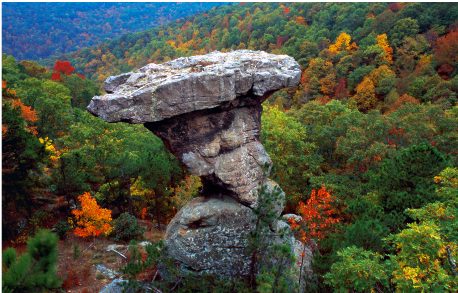
Pedestal Rocks Scenic Area, Witt Springs, AR.

Full Year Resident.....AR1000F Non-Resident.....AR1000NR Part Year Resident.....AR1000NR