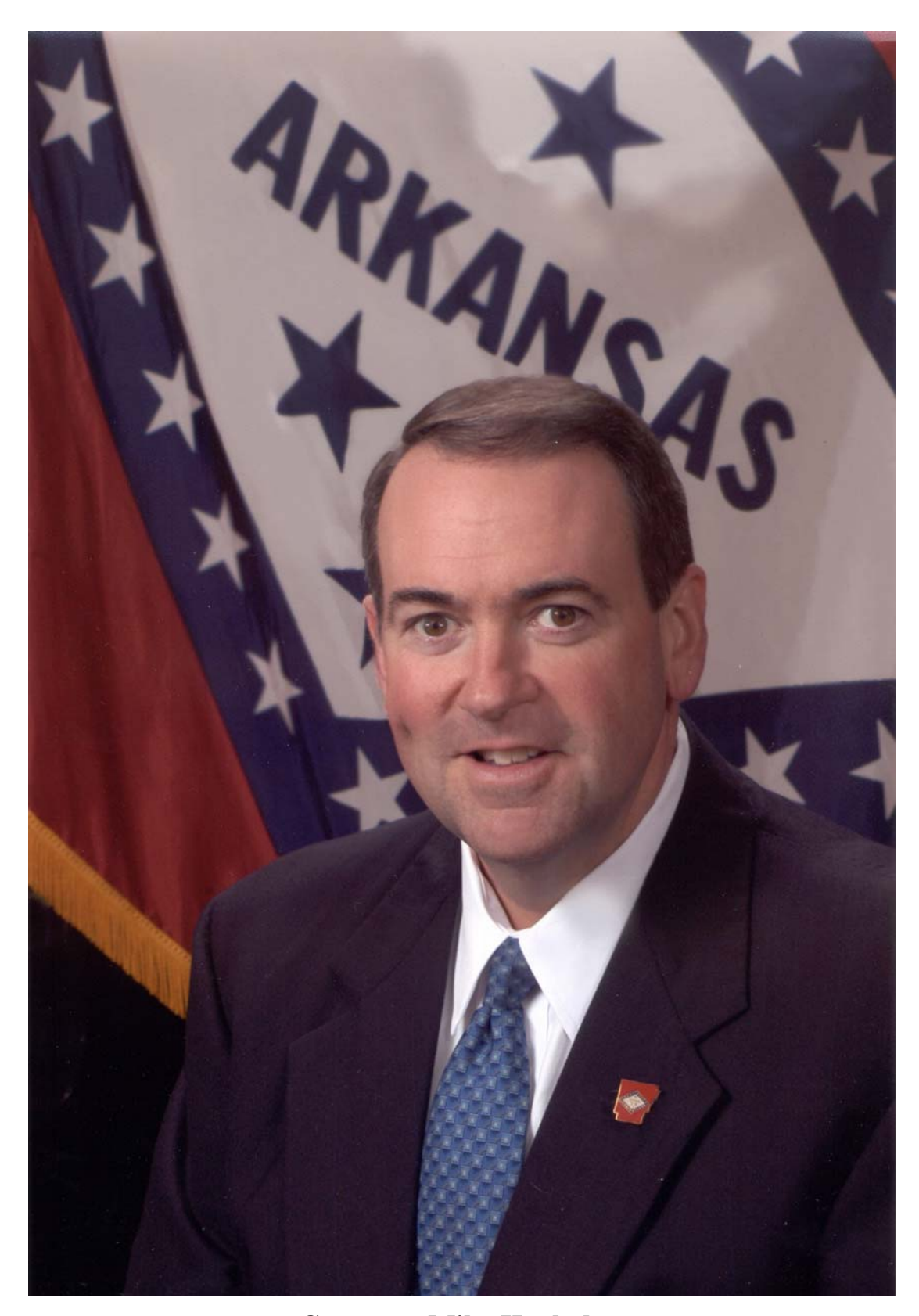
Governor Mike Huckabee